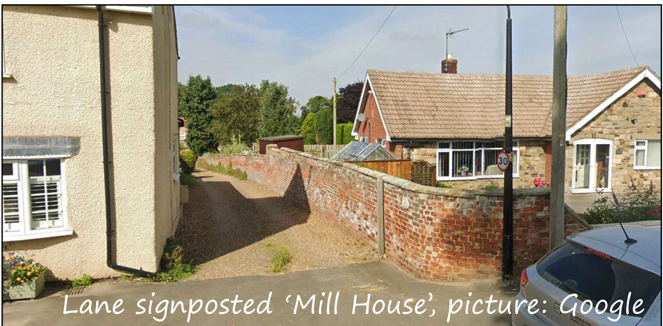
Lane signposted 'Mill House', picture: Google

Go up a slightly rising farm track into another field – on the Ordnance Survey map Underwood Plantation is shown on your left but this was felled in 2014. At the next open field boundary is a crossroads of footpaths with distant views of the Dales ahead and the Hambleton Hills behind you.